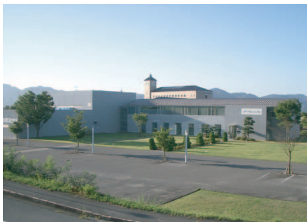
Head Quarters (Higashi-Hiroshima)